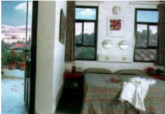
Inside of a Suite

Volunteers sleep in air-conditioned suites, four to a suite. Each suite is self-contained with its own bathroom, television, telephone, separate entrance, and private balcony. Clean linens and towels will be provided twice a week, or upon request. The rooms have a small refrigerator as well as a hot pot with supplies for coffee and tea. The suites are built along the hilltop in four rows following the contour. The rooms overlook the valley floor below.