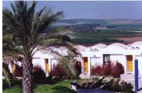
Individual Rooms from outside